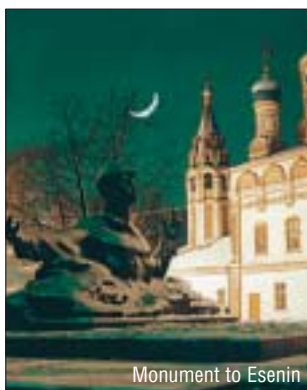
Monument to Esenin

Traditional Holidays “The city and its museum” is held in Ryazan History and Architecture preserve museum every first Sunday of July. All day long visitors and participants of the trip can visit the museum free of charge, assist at a spectacular performance, concerts, historical and local lore quizzes and a fair of souvenirs made by Ryazan