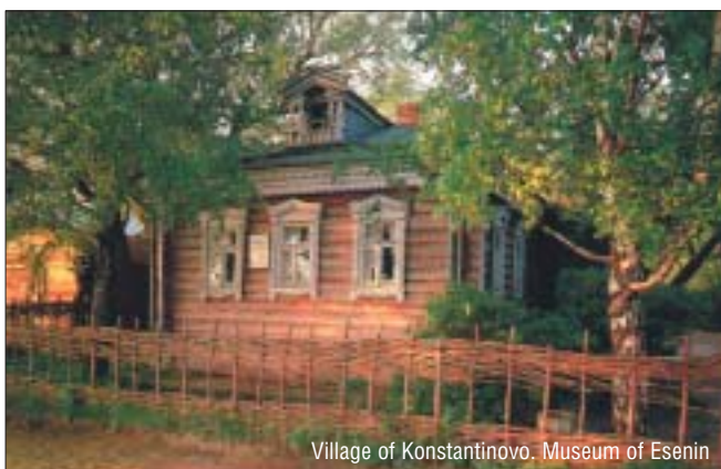
Village of Konstantinovo. Museum of Esenin